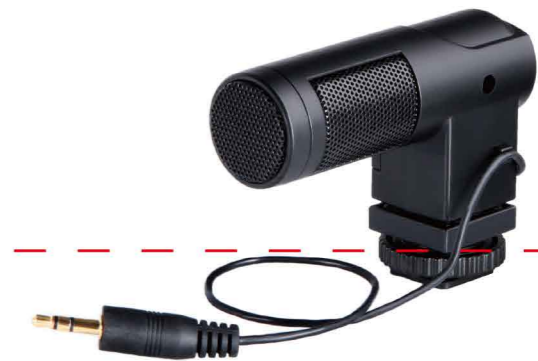
BY-V01 Mini Stereo Microphone